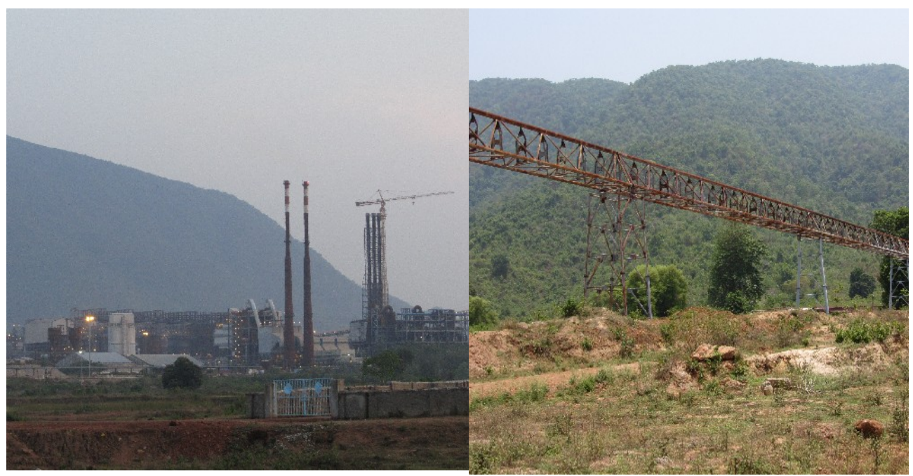
Lanijargh refinery at the foot of Niyamgiri

After several contenders failed, the UK registered Vedanta Resources stepped in 2003(Sterlite a subsidiary of Vedanta had the lease application pending since 1997) They quickly built the Lanjigarh alumina refinery at the base of the mountain before obtaining any permission to mine the hills. Contrary to the arrogant assumption that their money would buy the mountain against the inhabitant's wishes, years of local and international protest finally led to with-holding of the project by the Environment ministry in August 2010.