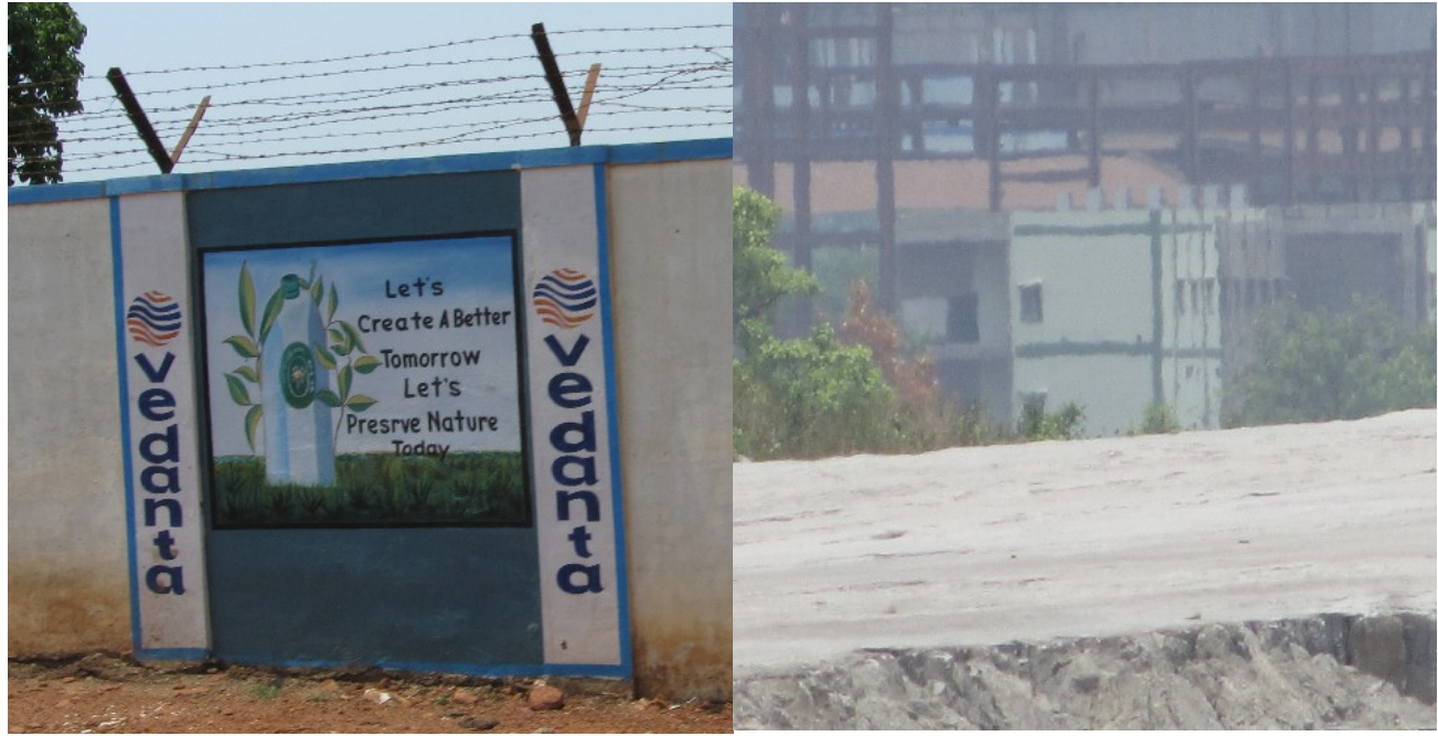
One of many eco-messages on the factory walls. The fly ash dump piled high in village fields.

Vedanta logos can be found at every turn, advertising a school, a science college and mid day meal centre. But the company's claims to Corporate Social Responsibility (CSR) have been exposed as far from the reality. They have vastly over-exaggerated their good works in reports and have even been caught claiming ownership for existing government schemes in the area. Local people have whitewashed Vedanta's logo from walls on nearby schools which had nothing to do with the company.