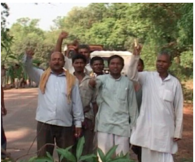
Activists block the road while trucks queue

On the same day, a five day Padayatra (walking protest) was culminating in Chhatarpur village on the Niyamgiri hills with a meal and meeting for 500 people from the Niyamgiri communities. During the march 40 people travelled from village to village, sharing stories and strategies on dealing with the state violence being enacted on them in the name of anti-terrorist policy. Operation Green Hunt is presented as a programme to eradicate Maoist extremists. In fact it is being used to divide and destroy tribal and other community opposition to industrial projects in the so-called 'red corridor' (Chattisgarh, Odisha, Jharkhand, West Bengal and Andhra Pradesh) by murder in fake-encounters, rape, harassment, and by labelling movement leaders as Maoist in the media.