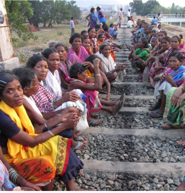
Women sit on the tracks, with the factory behind.