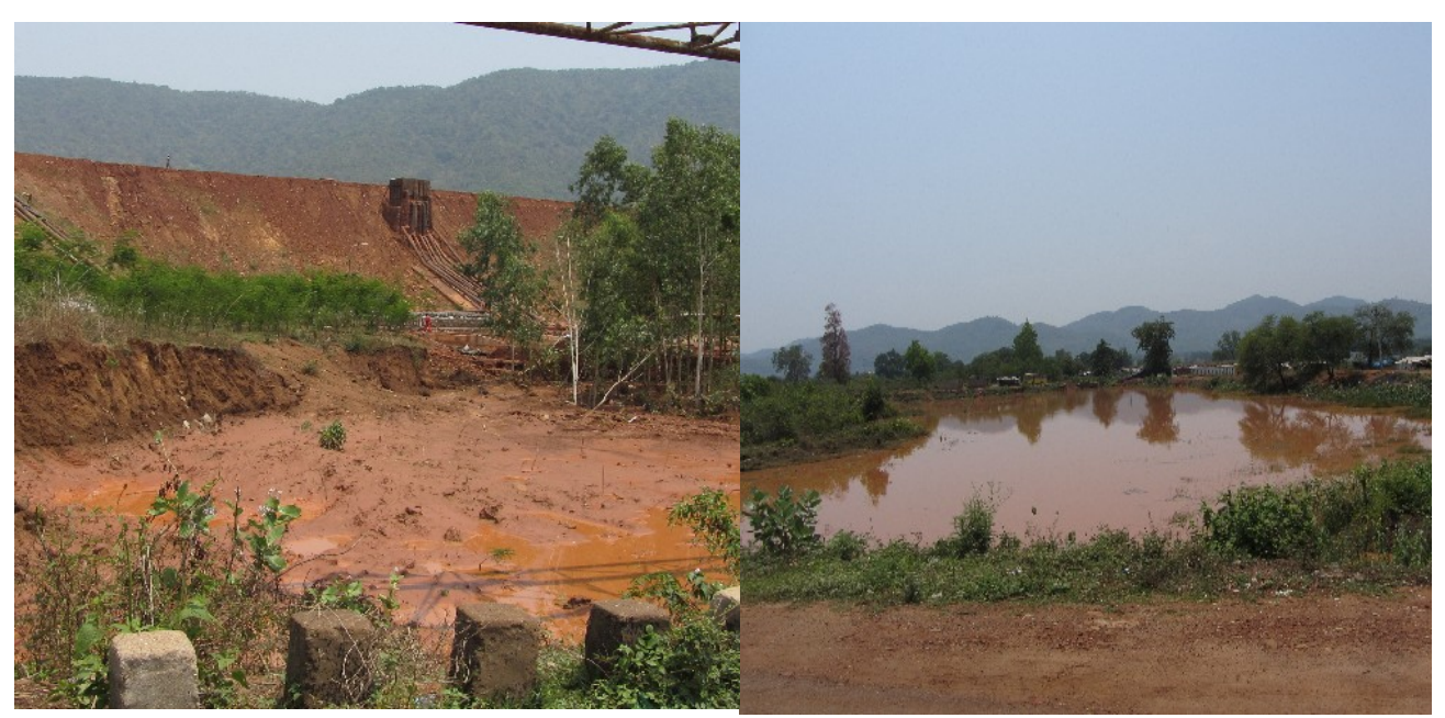
Scar left by red mud spill. Earthen banks of red mud pond in background.

"Now we don't drink its water because of the waste from the refinery that flows into it, but people still use the river for bathing and washing clothes. We are getting eye, skin and respiratory diseases due to this but we don't have other options"